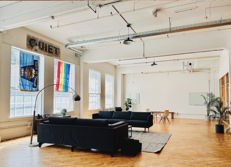
clockwise from top left: community space (angle 1), desk with 6 chairs, conference room, seating area, closed door office, community space (angle 2)